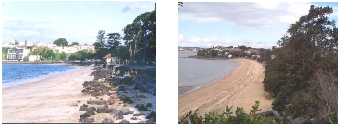
Figure 1. Mission Bay Auckland with seawall and rock armour (negative environmental outcome) and after it was renourished with sand from Pakiri Beach (positive environmental outcome).

on natural character, are not contrary to many District Plans, and do not reduce the amenity value of the area for the wider community. "Negative environmental outcomes" may be options based around shoreline armoring (or some other hard engineering option) (Figure 1) which although may succeed in stopping the shoreline from retreating further (and benefiting a relatively small number of people) will generally lead to a loss of high tide beach and natural character of the area. The authors recognise the value judgement inherent in this definition but feel it is necessary and is not out of step with current thinking and the changing paradigms in coastal management described earlier.